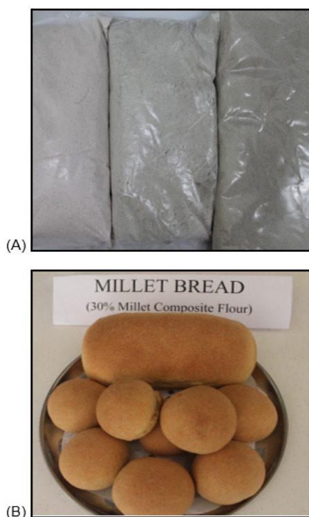
Figure 2. (A) Millet flour, and (B) millet bread.

Texture and taste were the most influential predictors of the bread acceptability. This observation is in agreement with the assertion by Kihlberg (2004) that taste and texture are the most important quality indicators of bread which influence acceptance. Even though appearance and aroma are essential attributes and might affect the acceptability of food products, they did not significantly ( p < 0.001 ) influence panellists' preference for bread made from millet-wheat composite flour. The performance of the different millet varieties in the final product, in respect of the key sensory attributes was quite promising. Mean scores of 5.97 (appearance), 6.06 (aroma), 5.92 (taste) and 5.87 (texture) which were interpreted as "slightly like" were obtained.